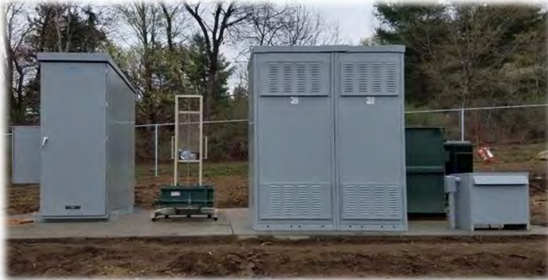
Figure 1: BrightPwr - 1MW Community Power Engineered Solar Power Collector & Protection System Pad mount NEMA 3R Non-Walk-In