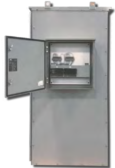
Figure 11: SBU-Series – 2000A AC Collector & Ground Fault Protection Switchboard