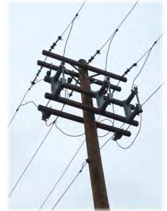
Figure 2: Pole Mount Fused Cutouts & Disconnect Switch