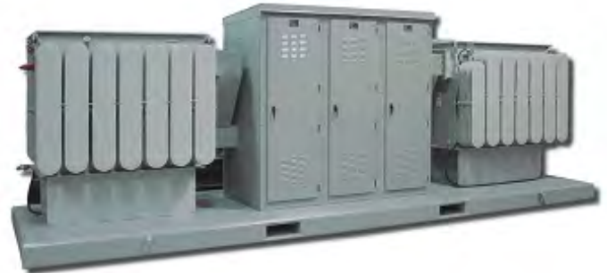
Figure 19: PwrSkid - 2.5MW Pre-wired Outdoor Skid-mounted Transformer & AC Combiner Switchgear