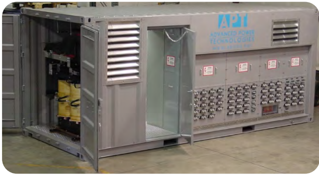
Figure 18: PwrContainer - Pre-wired Outdoor Walk-In ISO Container Based Solar Power Transformer & Combination Modules