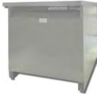
Figure 10: ZZX-Series - Zig-Zag Grounding Transformers