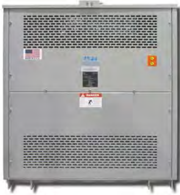
Figure 9: ZGR-Series - Neutral Grounding Reactor