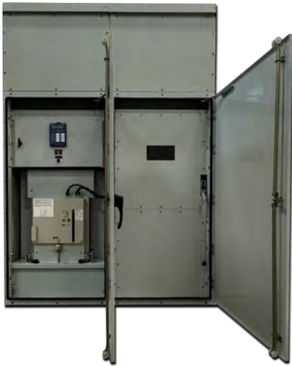
Figure 3: Solar Disconnect Hookstick Drawout Circuit Breaker with Utility Isolation Switch NEMA 3R