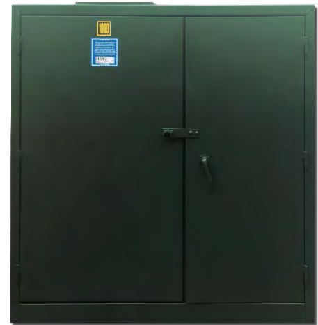
Figure 8: PTX-Series - 1000kVA Solar Step-Up Power Transformer