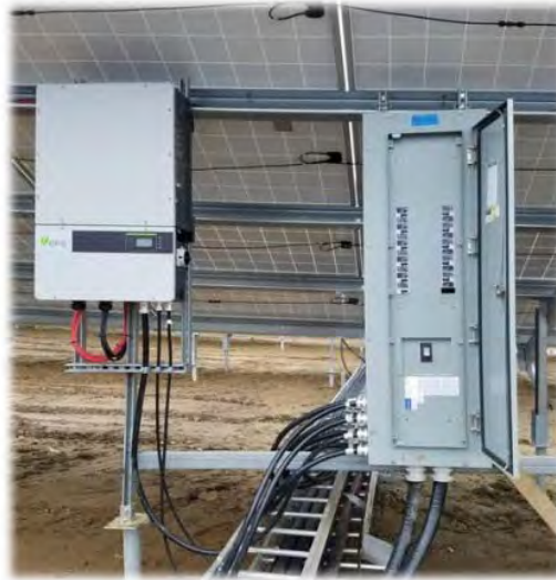
Figure 15: 600A Solar Combiner Panelboard Installed