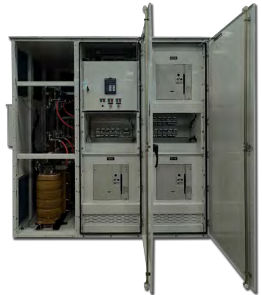
Figure 5: MED-Series - 10MW Utility Intertie & Solar Aggregator Protection Switchgear