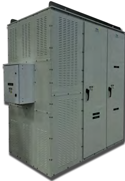
Figure 4: 5MW Solar Farm & BESS Integrator Utility Intertie Switchgear