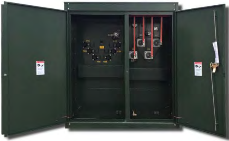
Figure 7: PTX-Series - 2000kVA Solar Step-Up Power Transformer NEMA 3R