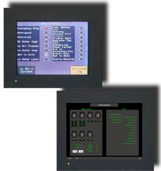
Figure 2: 5.7" Remote Annunciator Digital Color Touchscreen