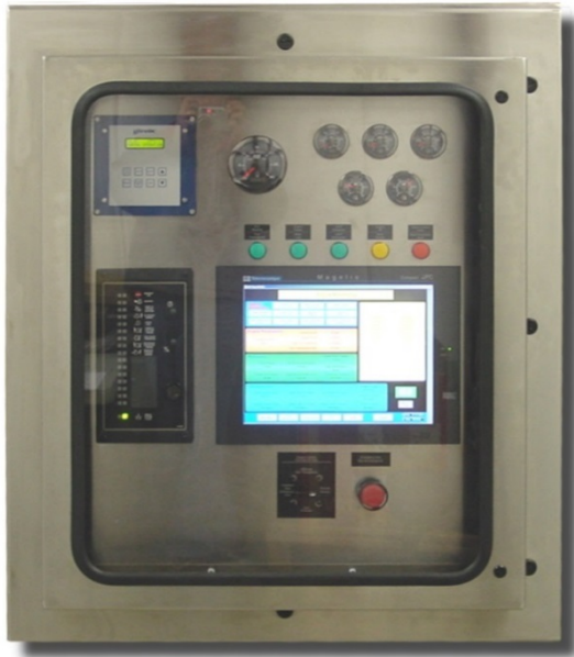
Figure 1: Digital Remote Annunciator & Control Panel 316 Stainless Steel NEMA 4X Enclosure