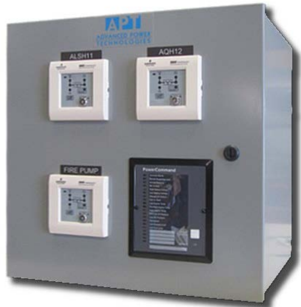
Figure 4: APT Emergency Power Monitoring Panel for Three Automatic Transfer Switches & One Cummins Generators